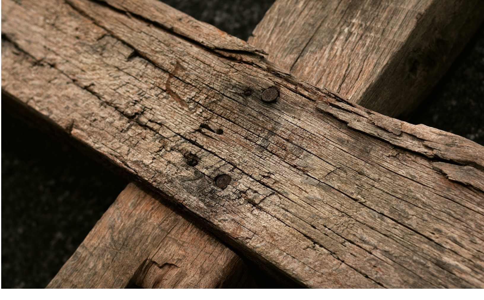
HOLY WEEK & EASTER LITURGICAL RESOURCES